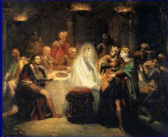
(Macbeth sees Banquo's ghost at the feast)